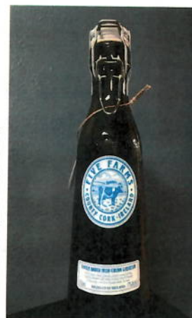
FIVE FARMS *Irish Cream Liqueur*

PHONE 218-342-2091 MON-THU 9am- 9pm FRI-SAT 9am-10pm SUN 11am – 5pm