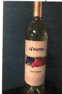
14 HANDS *Pinot Grigio*